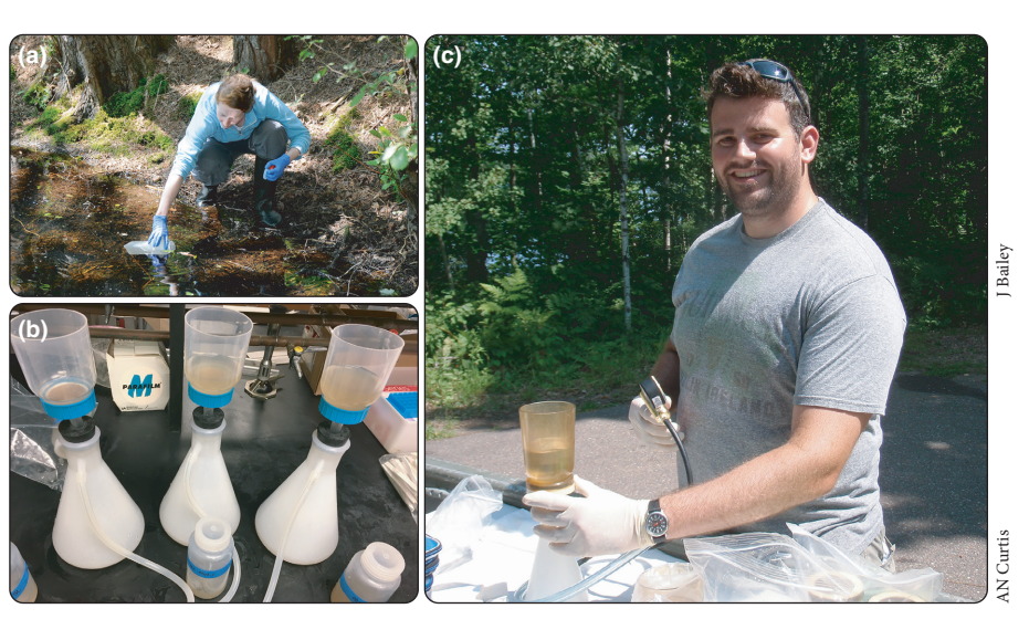
Figure 1. A typical process of using eDNA for invasive species surveillance includes (a) collecting environmental samples and (b) capturing DNA through a method like filtering water through fine pore cellulose nitrate filters, which may be performed in the laboratory or (c) immediately under field conditions. Stored samples can then be extracted in the laboratory and analyzed using single species (eg quantitative or real-time PCR) or multispecies (eg metabarcoding) approaches.

Users of eDNA technologies should be aware of some potential pitfalls (Roussel et al. 2015). Both false negatives (the failure to detect a target species when actually present) and false positives (the detection of a target species when actually absent) can occur with eDNA surveillance, just as they can for many other monitoring approaches in applied ecology (Ficetola et al. 2015). False negatives in eDNA can be caused by such factors as poor assay design or inhibition of PCR by common