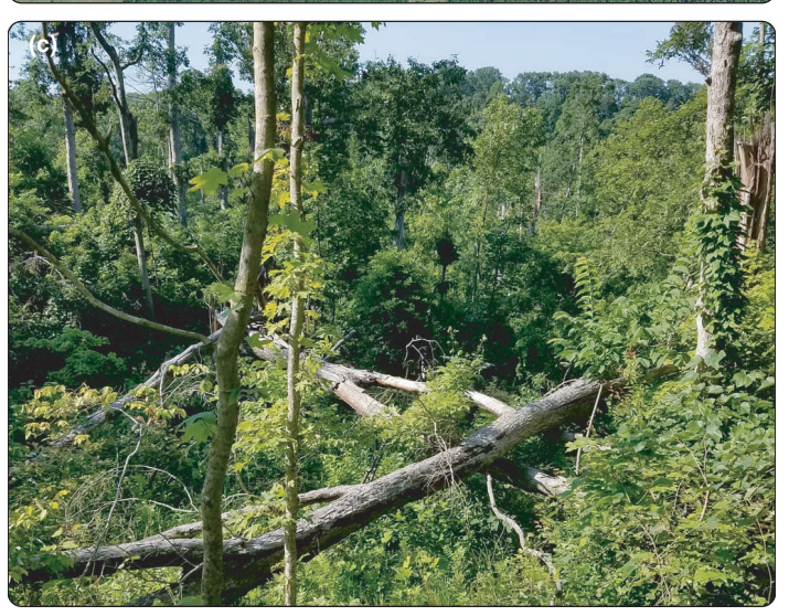
Figure 3. Daniels and Larson (2020) demonstrated how remote sensing can be used to map disturbances like forest blowdowns (a) before and (b) after tornadoes or other wind storms. (c) These disturbed patches may be priority sites for monitoring biological invasions, including non-native understory plants. One-meter-resolution remote-sensing imagery in panels (a) and (b) from the National Agriculture Imagery Program.

ranging from medium to high spatial resolution is available for free from many sources, including Sentinel-2 (10 m); Landsat Thematic Mapper (TM), Enhanced Thematic Mapper Plus (ETM+), and Operational Land Imager (OLI) (30-m resolution); and the National Agricultural Imagery Program (1-m resolution). Some applications require expensive custom imagery for increased spatial, temporal, or spectral resolution, but costs of custom imagery are falling with the increasing use of UAVs (Koh and Wich 2012). Camera trapping has increased in sophistication and become more affordable (Burton et al. 2015) since its inception, making it a cost-effective management tool, especially when combined with image recognition software.