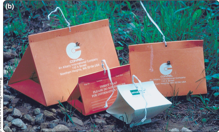
Figure 2. (a) Panel traps with chemical lures based on sex and aggregation pheromones are used to detect native and introduced wood-boring cerambycid beetles in central Illinois. In addition to presence—absence data, these traps provide information on mating phenology and conspecific attraction. (b) An assortment of pheromone traps used to detect outbreaks of forest or agricultural pests.