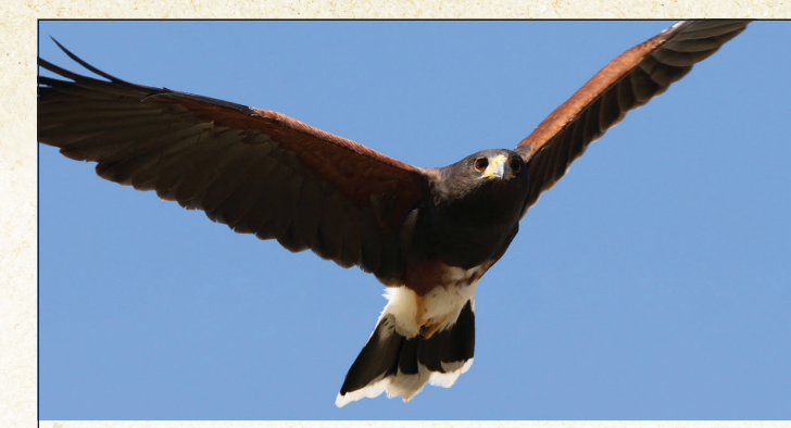
FÓR YOUR GENEROUS SUPPORT AND CONTRIBUTIONS.