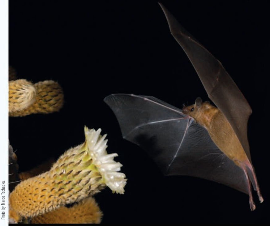
Lesser long-nosed bats provide essential linkages to ensure sexual reproduction among many columnar cacti in the Sonoran Desert.

Does this era of modern molecular biology spell doom for organismal biology? Today, natural history, the description of nature, is more likely to grace the pages of popular magazines than of leading scientific journals. Natural history developed into the science of organismal biology, including ornithology, ichthyology, mammalogy, and others. Compared to modern molecular genetics, these taxon-specific fields often seem to be in academic decline, receiving less science funding and less academic attention. Modern biologists have been increasingly turning their attention away from particular species toward genes and ecosystems. As one of my colleagues once put it, "DNA is DNA. I don't always know what the animals even look like." At the same time, the modern conservation movement has also been trending toward a focus on conserving ecosystems, rather than on protecting single species one at a time. This holistic approach is efficient because habitat destruction and anthropogenic changes at the ecosystem level are problems that threaten multiple species. From this perspective, one might wonder why we should even focus time and energy specifically on bats. It may seem that by simply protecting habitat, we will be protecting bats alongside other wildlife, and we might not need to know detailed ecological information about the lives of bats.