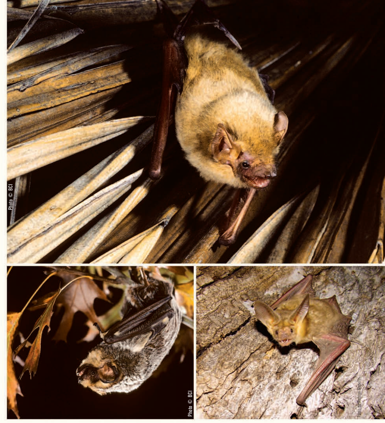
Opposite page: Pallas's long-tongued bat drinking nectar from the flower of a morning glory tree. Top: Western yellow bat in palm frond. Bottom left: Hoary bat in oak tree. Bottom right: Pallid bats seek their prey on tree trunks, vegetation, or rocky substrates.

Scott Richardson Supervisory Fish and Wildlife Biologist, U.S. Fish and Wildlife Service