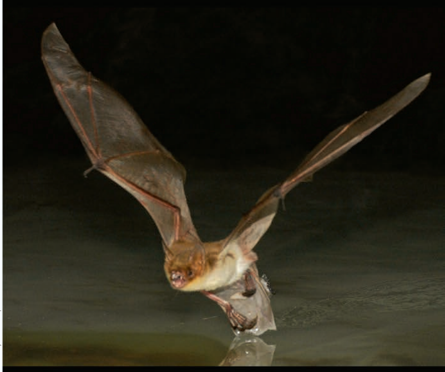
he flight of a Baja California fish-eating bat is observed in a flight cage.