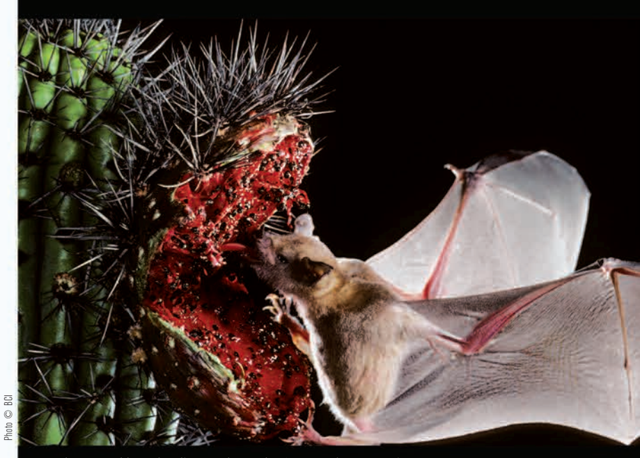
esser long-nosed bats also disperse the seeds of many columnar cacti.