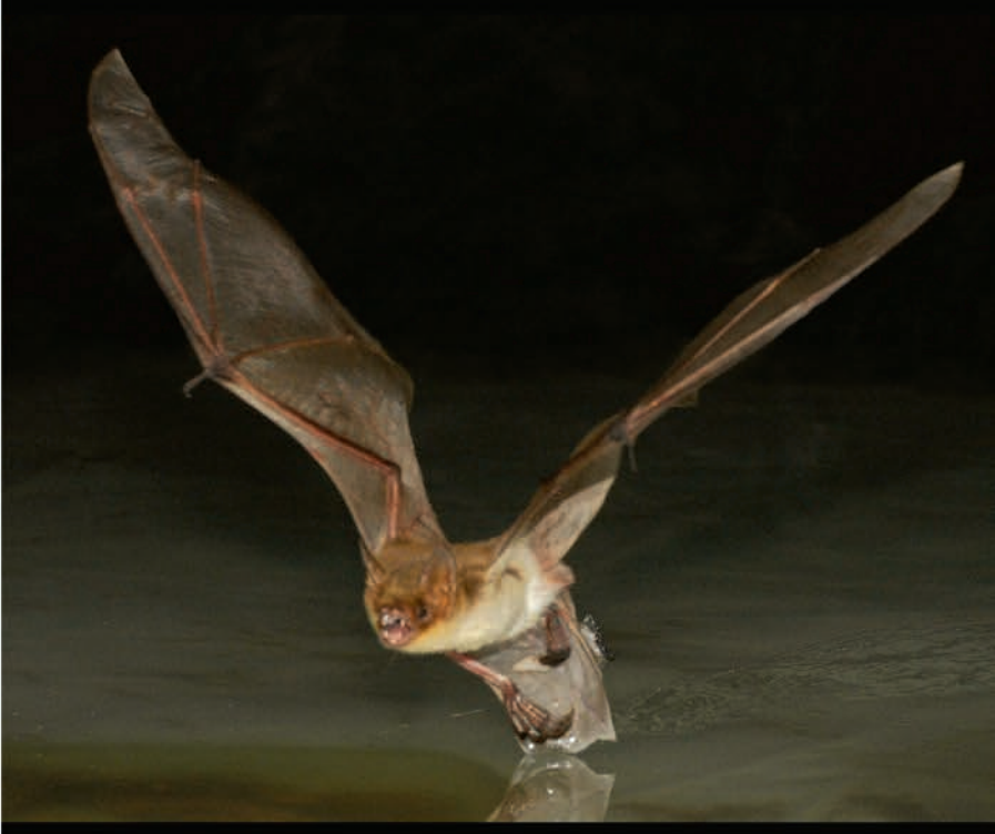
he flight of a Baja California fish-eating bat is observed in a flight cage.