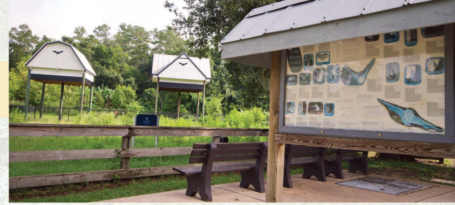
Bat houses at the University of Florida in Gainesville. Florida, host tens of thousands of bats and are a local attraction.