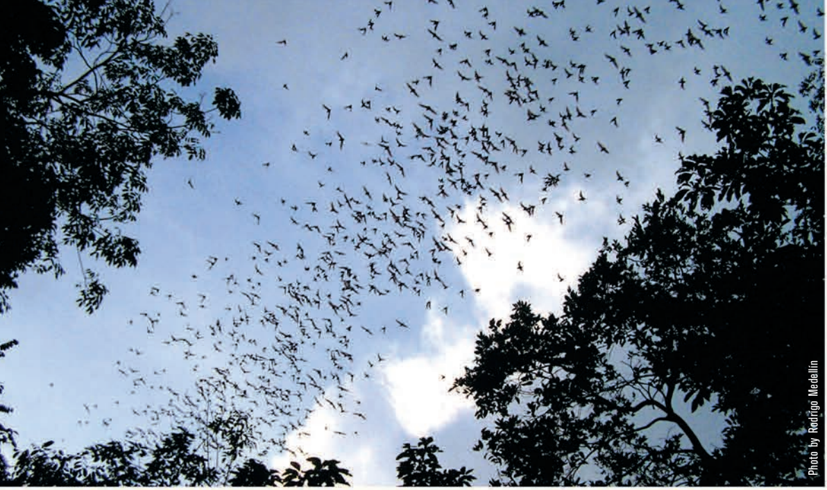
Top left: Man made bat roost attached to a palm tree. It appears that bat houses on trees, however, are not as successful as those on walls. Top right: Lesser long-nosed bat with pollen on its head. Bottom: Bats emerging in large numbers from a cave in Mexico.

populations. Thousands of bats are killed by turbines annually. Treedwelling species may be attracted to turbines because they resemble large tree snags that are attractive roost sites. Beyond direct collision with blades (which have tip-speeds up to 200 mph), researchers have found that a change in air pressure near the blades causes fatal internal bleeding in the small-bodied bats. The placement of wind farms, avoiding areas that are important to bats and other wildlife, will be critical in reducing deaths, as will curtailing turbine use during peak migration periods. Luckily, many wind energy corporations are interested in working with conservationists to solve this emerging problem. Bat Conservation International has a strong program to help and has provided guidelines for mitigating the effects of wind turbines. In Arizona, the Game and Fish Department also has "windwildlife guidelines" to help developers examine potential impacts of their projects on wildlife and to guide essential monitoring studies that should occur before and after construction.