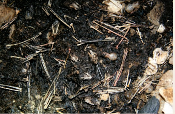
Top: Northern long-eared bat (Myotis septentrionalis) infected with White Nose Syndrome. Characteristic white fungal growth is visible on forearm, ears, and nose areas. Bottom: Pile of bat bones in bat guano, demonstrating the severity of mortality associated with WNS, at Aeolus Cave in Vermont. Cut out: A cluster of little brown bats in hybernation in Aeolus Cave, Vermont.