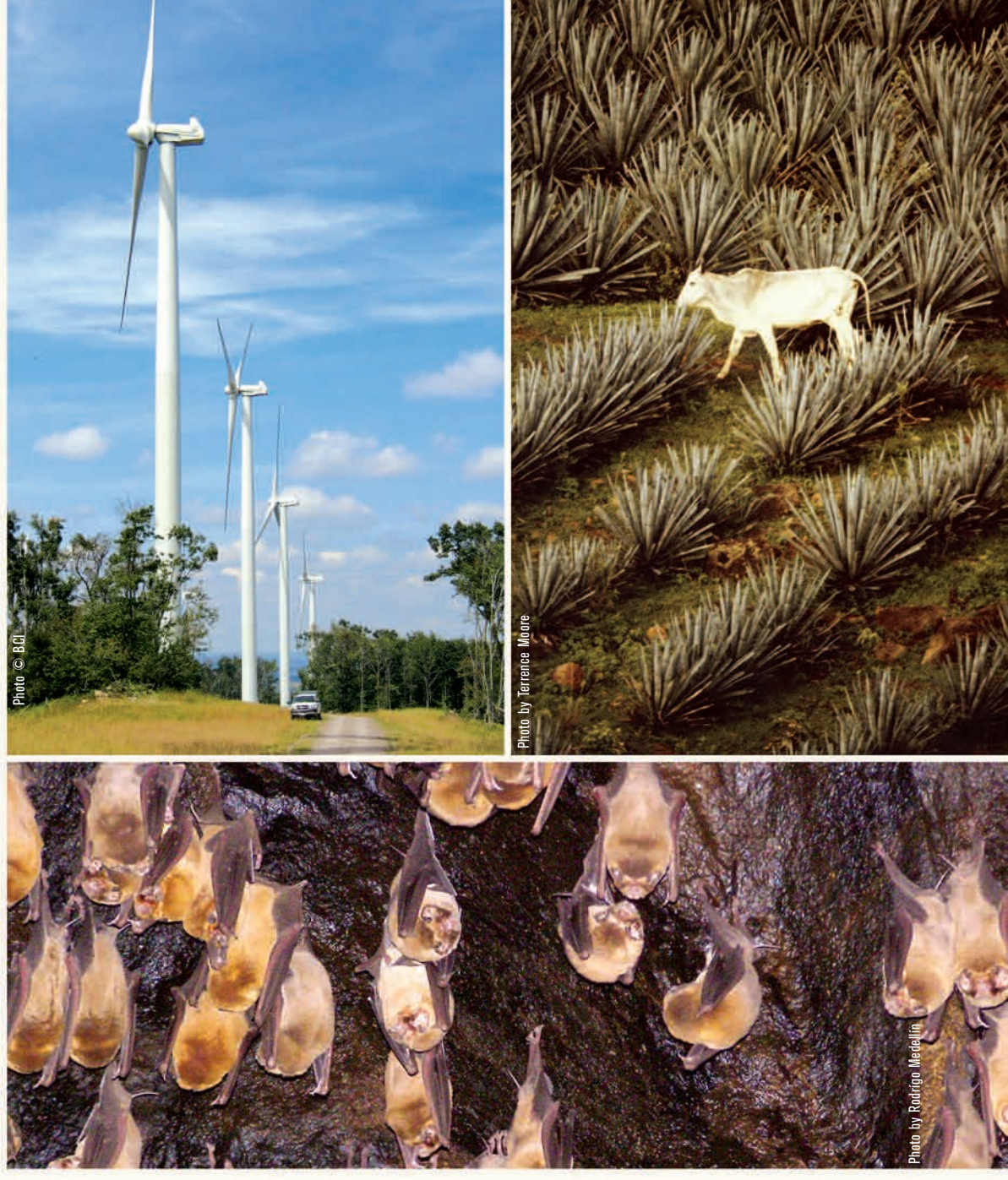
Top left: Wind turbines have caused significant mortality in migrating bird and bat populations. Top right: Cow walking through an agave field grown for tequila, where the agave plants are prevented from blooming and thus are useless as food for bats. Bottom: Ghost-faced bats roost in large numbers in caves.

On their migration routes bats need a reliable supply of suitable roosts, food, and water. But those resources are increasingly threatened. Pesticide use decreases foraging opportunities for insect-eating bats, and land conversion that reduces populations of columnar cacti and agave can leave nectar-feeding bats with little to eat. One of the biggest threats to our migratory nectar bats is agave cultivation for tequila production, which leads to food gaps along large stretches of their migratory corridor. Because the agave used to produce tequila is typically prevented from flowering, bats reaching these areas are unable to find food. Fortunately, BCI and others have worked with growers to plant "hedgerows" of native agave that will be allowed to flower. This keeps the nectar corridor intact and provides migratory bats with essential fuel to reach their destinations.