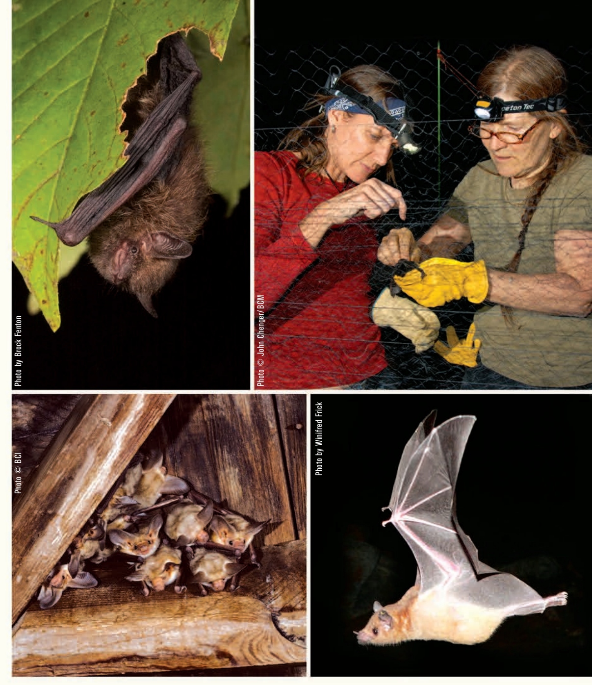
left: The tri-colored bat (Perimvotis subflavus), an insectivorous bat common in the East from Canada to Mexico and Central America. is thought to roost in foliage or tree cavities. Top right: Janet Tyburec of BCI with bat workshop participants near Portal, Arizona. Janet is demonstrating how to safely remove bats from mist nets and handle them properly so they can be identified, measured, and recorded. Bottom left: Pallid bats hanging from rafters in a shed. Bottom right: Lesser long-nosed bats are powerful fliers, migrating over 1,000 miles each year.

Bats are not related to mice. but shrews and moles and bats evolved from a common ancestor living 60 or 70 million years ago.