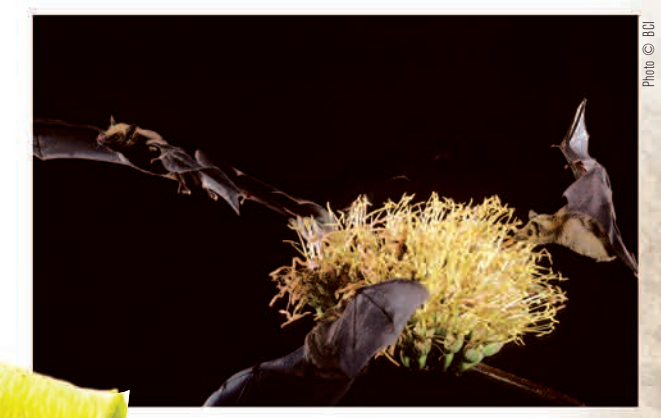
Lesser long-nosed bats pollinate an agave. Right: Mexican free-tailed bats form tight clusters on the ceiling of a cave. Cut out: Shot of tequila with limes. Tequila is made from agave plants.

humans. Their pollination of agave is essential not only to the ecosystems, but to many humans too. Agaves are the source of many useful productsfrom natural ropes and string to syrups, to the larvae of a moth used as food in central Mexico, to tequila, mescal, and other beverages. Many millions of dollars are derived from the relationship between bats and agaves; in fact, tequila sales represent almost one billion dollars annually.