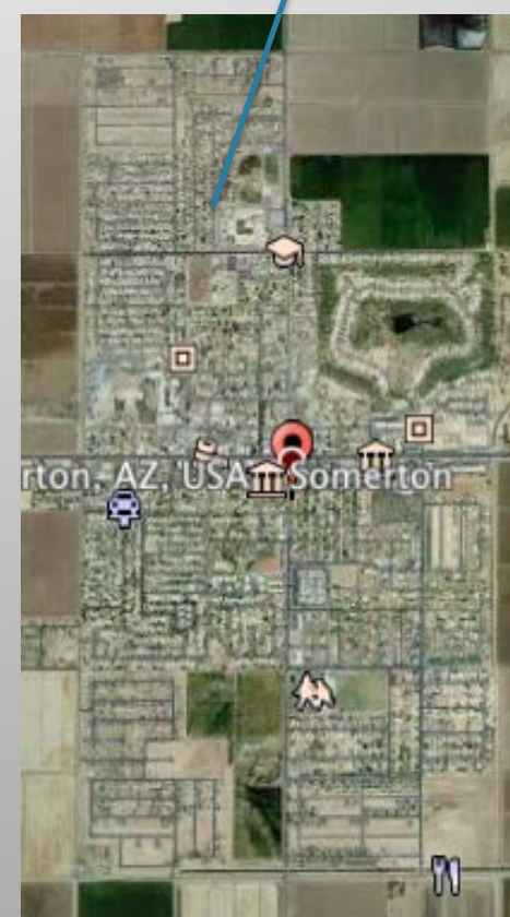
City of Somerton 2013

Somerton takes up 1.3 square miles of land (2013).