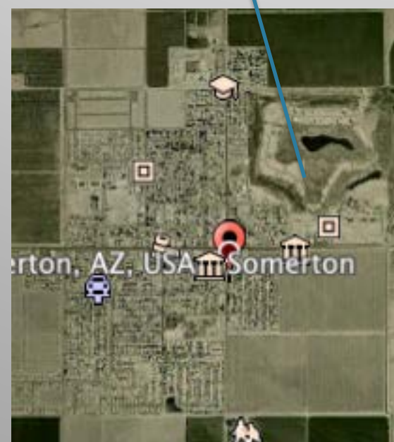
City of Somerton 2000