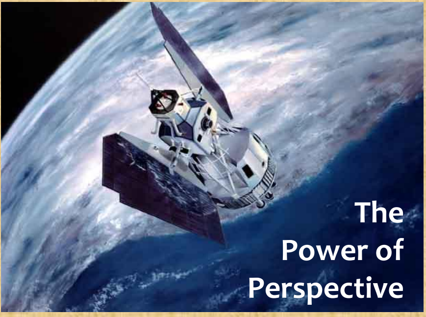
Artist's view of a U.S. Landsat satellite.