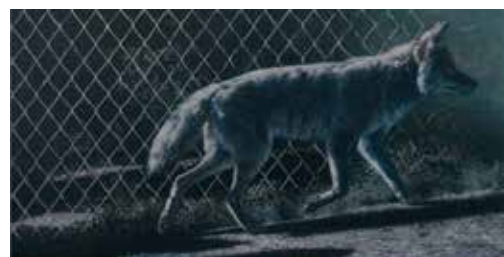
Andrew Denman, "The City Boy Blues", acrylic

Opening Reception: Saturday, September 19, 2-4PM