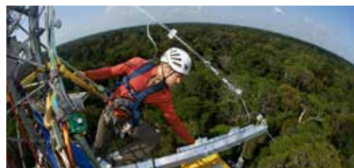
Artist on Location

Opening Reception: Saturday, July 11, 2-4PM A timeless exhibit depicting disappearing wildlife of the Sonoran Desert