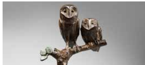
Hélène Arfi, "Two Barn Owls", 2013

Visit our website for comprehensive information about our exhibits >> www.desertmuseum.org/arts