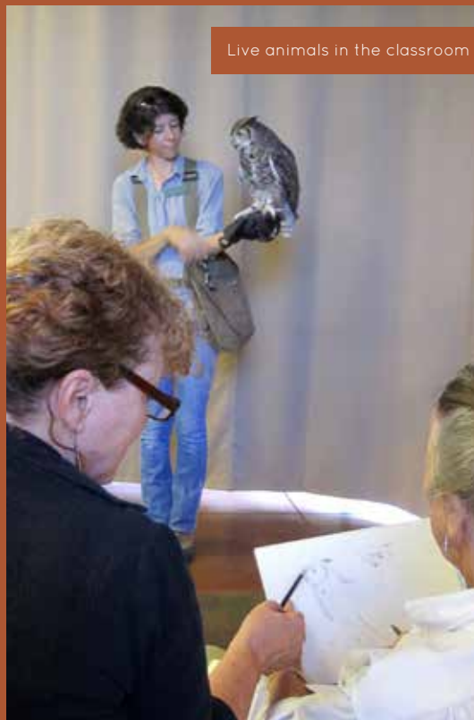
Live animals in the classroom