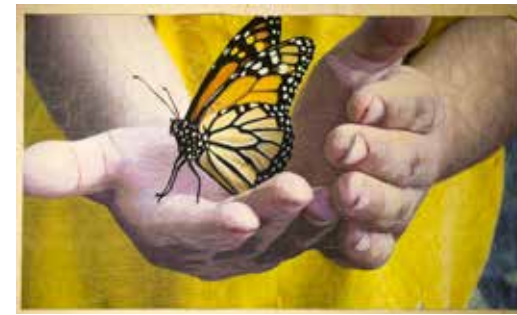
Jennifer Day, "Garden Wonder", quilt

IRONWOOD ART GALLERY >> OPEN DAILY 10AM - 4PM