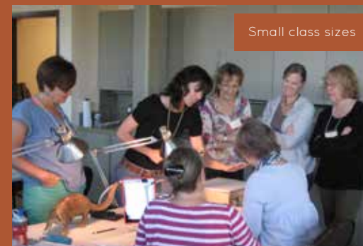
Small class sizes