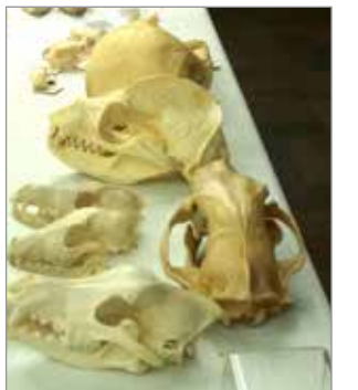
Blending science with art

This workshop is set up to give art students a taste of a lab class, to gain their own appreciation and understanding of what goes on under the hair of mammals. Studying the skull and entire skeletal system will give a glimpse into the animal's lifestyle, and help with life sketching. Students learn to identify different mammal groups from skulls alone, and also gain a better understanding of the skeleton and postures. See connections from skeleton to living animal for developing life-like poses. Spend the day developing your personal skull and bone identification journal, with special focus on Sonoran Desert mammals. Be inspired by the sculptural qualities of the skulls and bones themselves. "One of the great pleasures of being a scientific illustrator was my science education and exposure to laboratory classes where I could learn about the intricate and amazing similarities and differences among animals. As an artist, I have made use of that knowledge to better understand how to depict animals accurately, whether with a lot of detail or minimal lines." –Instructor, Rachel Ivanyi