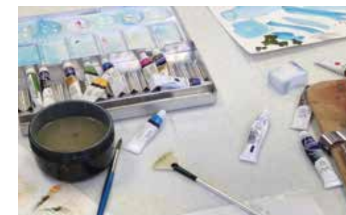
Learn a new medium!

Hello Watercolors! This popular introductory class is designed to help take the fear and anxiety out of using watercolor. Make friends with watercolor brushes, paints and paper and your classmates! Explore basic techniques through simple exercises and get comfortable with this versatile medium. Have a first encounter with color theory and mixing. Gain confidence in a friendly atmosphere with weekly demonstrations and lots of personal attention. This class will prepare you to "tame the beast."