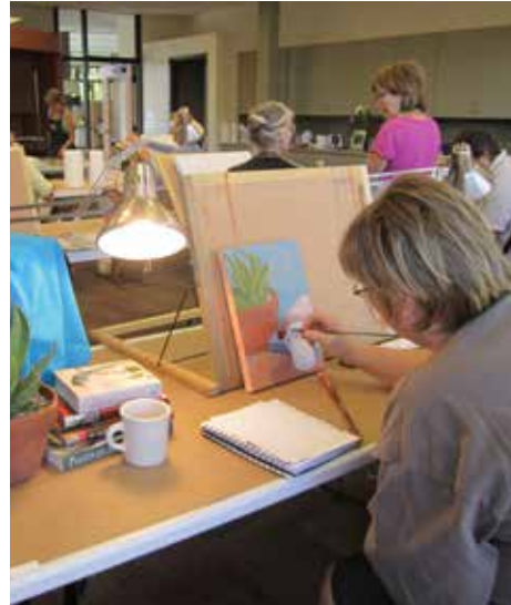
State of the art classrooms