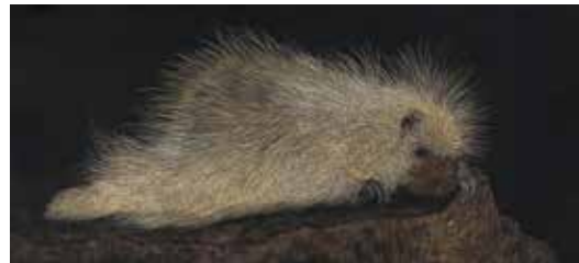
Priscilla Baldwin, "Prickly Heat", scratchboard

Conservation Documentary Film Screenings: January 10, Times will vary