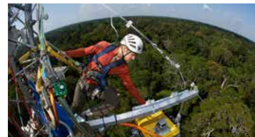
Artist on Location, Copyright Jake Bryant

A timeless exhibit depicting disappearing wildlife of the Sonoran Desert