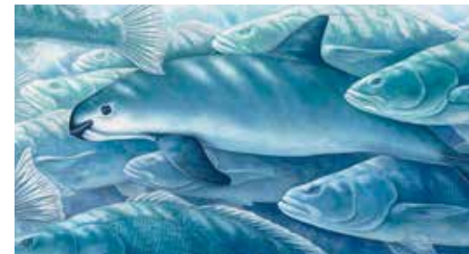
Net Loss, watercolor on cold press watercolor paper by Rachel Ivanyi. The Desert Museum's newest permanent collection acquisition. Two Critically Endangered species endemic to the Gulf of California: The Vaquita, Phocoena sinus, in a school of Totoaba, Totoaba macdonaldi.

Twenty-six studio art quilts by artists from ten states across the U.S. Representing some of today's most innovative American artists working in the quilt medium.