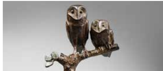
Hélène Arfi, "Two Barn Owls", 2013

*Exhibition located in the Baldwin Education Building Gallery, hours may vary