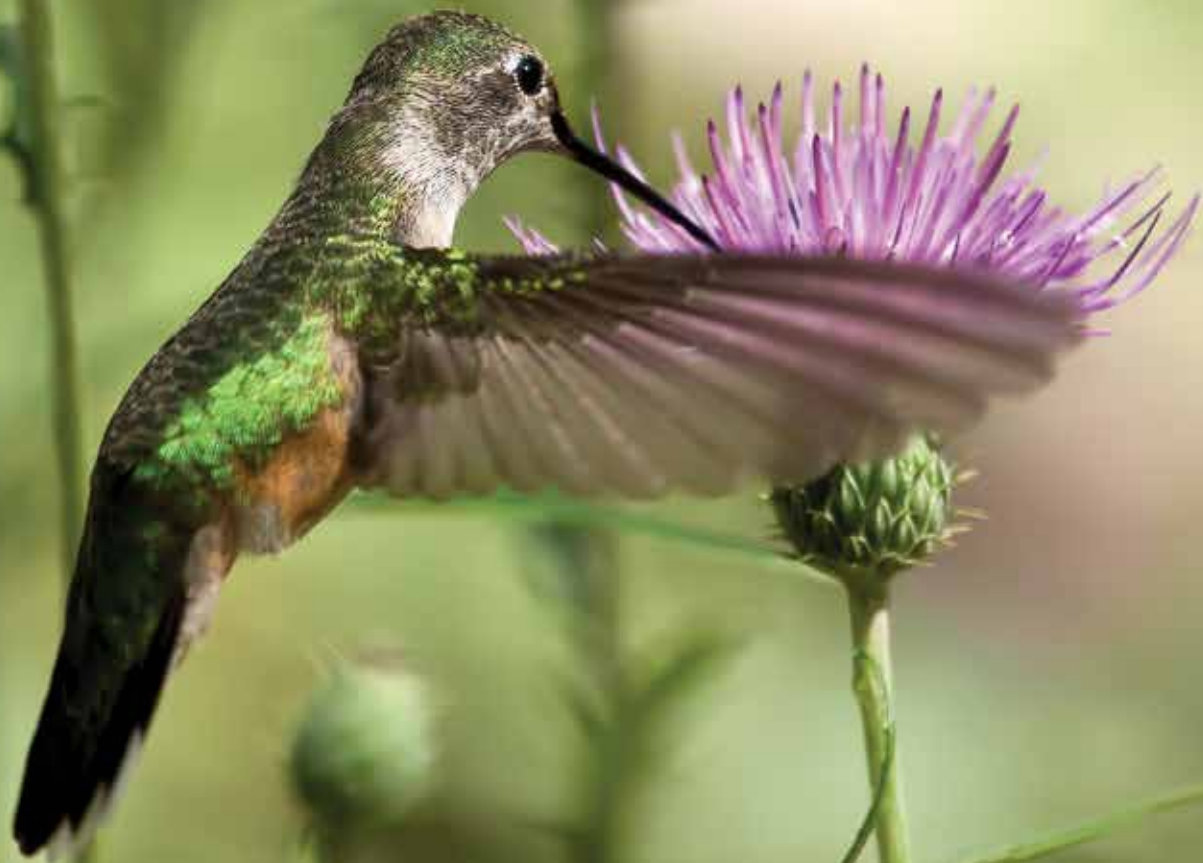
Rufous Hummingbird