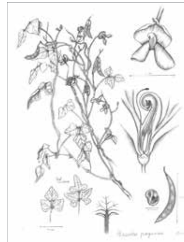
Botanical Plate Chris Bondante

Join natural science illustrator, Rachel Ivanyi, to take your drawing skills to the next level and get your Pencil II certificate requirement filled. This class will cover both Sonoran Desert plants and animals, but students will have the option to focus on whatever group they like. There will be emphasis on drawing from life, and developing accurate renderings. This class is for those students who want exposure to more traditional natural science illustration techniques, but still allows the freedom and flexibility for those who want to be more non-representational and use nature as inspiration. Each week this class will cover some of the conventions of scientific illustration as well as morphology of a plant or animal group to aid you in your exploration of the Sonoran Desert. Enjoy creating tonal studies or finished graphite illustrations, and also gain knowledge that will help in adding more dimension to your work in color.