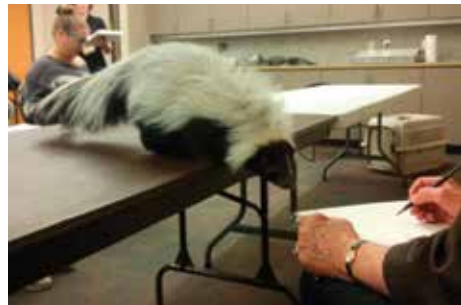
Animal Life Drawing with Holly Swangstu