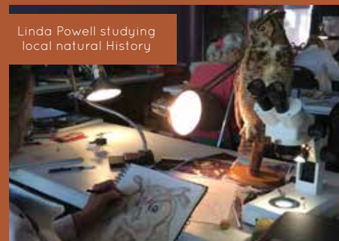
Linda Powell studying local natural History