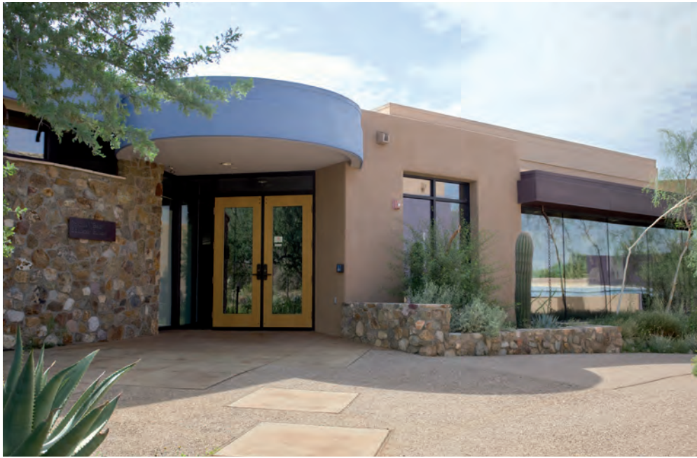
Baldwin Education Building.