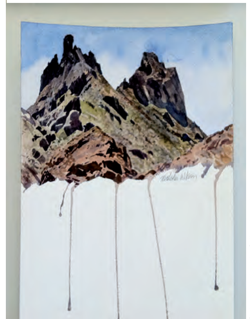
Pin location sketch. © Nicholas Wilson

The Baldwin Education Building is home to the Art Institute and features office space, numerous multi-purpose classrooms, and exhibit space. Additionally, the Museum's art collection is stored in an area built expressly for its safekeeping, with a receiving area for visiting exhibits. In late 2012 a dedicated art classroom/studio for Art Institute classes and a new location for the Desert Museum library will open on the lower level of the building.