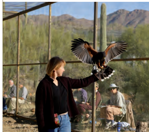
Raptor Free Flight meow.

"We've long exhibited plants and animals in excellent, naturalistic exhibits, written about them, talked about them, filmed them, and demonstrated their behavior and biology," Larson says. "Through the fine art works collected and/or exhibited at the Museum, and through Art Institute classes, the Museum staff, students, and visitors gain a valuable perspective of the plants, animals, and landscape. We see these things through the eyes of artists who, through their art, display their personal and emotional insights. Art stretches our minds, our connections, and our empathy for the desert and the living things within it."